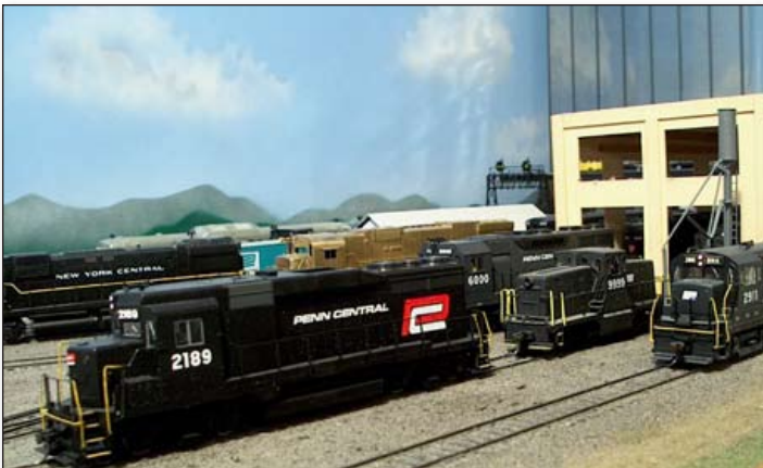
Engine terminal. Dave Zamzow