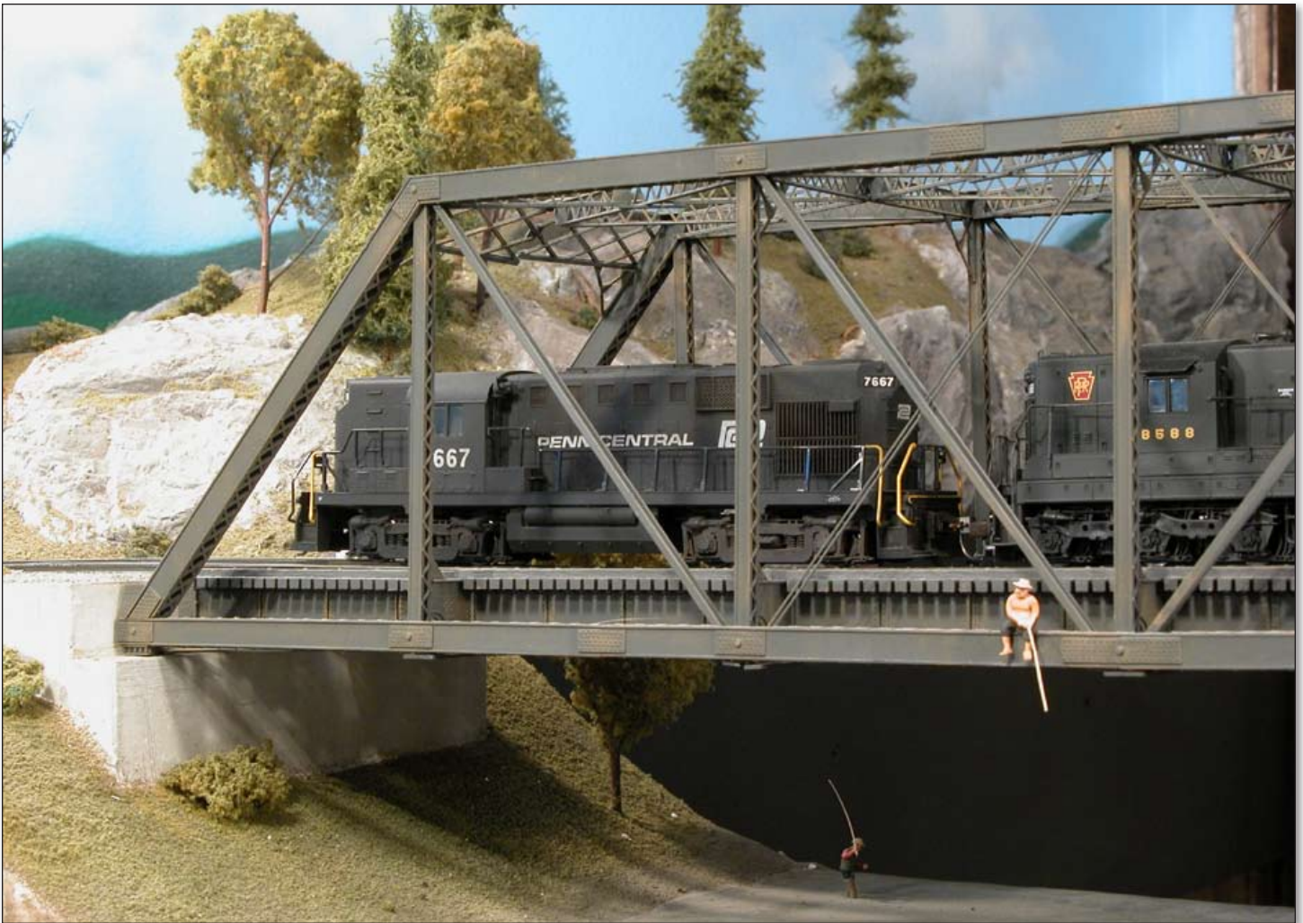
Fishermen ignore the rumble from an RS-11 and SD-9. Bob Sobol