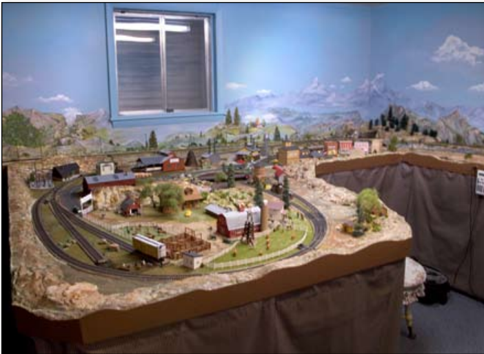
One half of the new Tusitteez layout. A track to the left heads to a turning wye and eventually will connect through Ted's shop and two other rooms with the Pine Valley.