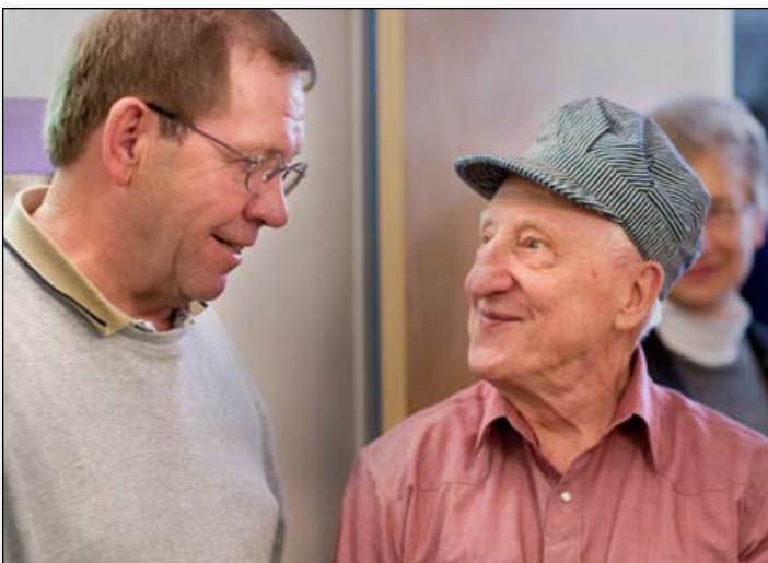
"Two very happy friends."